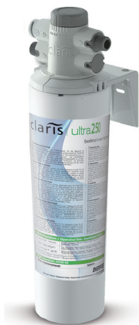
Head sold separately.

Claris Ultra 250-S Filter Cartridge: EV4339-80