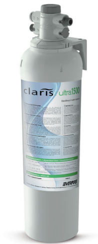
Head sold separately.

Claris Ultra 1500-XL Filter Cartridge: EV4339-83