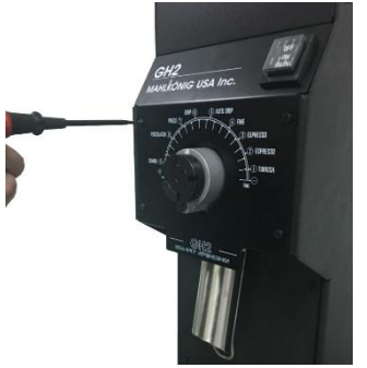
Step 2 - remove front cover step