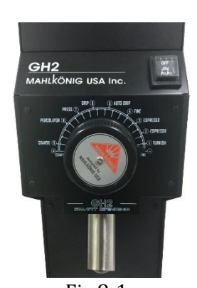
Fig 8-1 Finest position