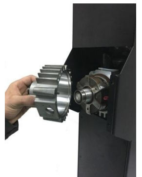
Step 6 -remove grinding house