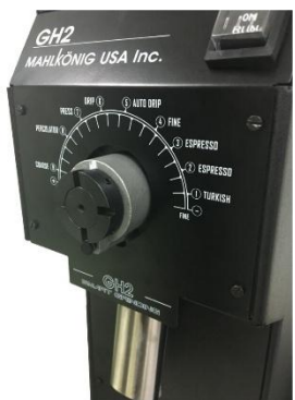
Step 4 note internal knob position