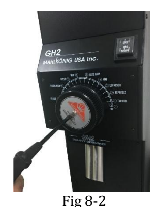
loosen the securing screws