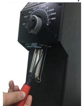
Step 1 -remove chute