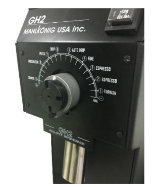
Fig 8-3 silicone and body markers