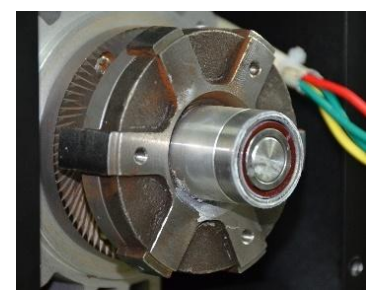
Step 7 –remove the bearing cover