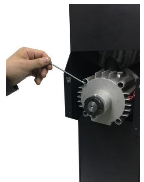
Step 5 – release grinding house