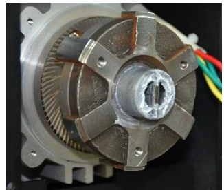
Step 8 -remove the shear key